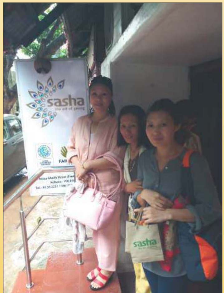
Exposure visit for team at SASHA, Kolkata, India

“We are proud to have a team from Bhutan, and feel delighted to train them in different aspects of recycling art. During the training program, I learnt Bhutan is a beautiful country, and we wish to go there once. As trainer, I must appreciate the team members from Bhutan for actively taking part in this hectic training regime and everyone is so talented and hard-working”.