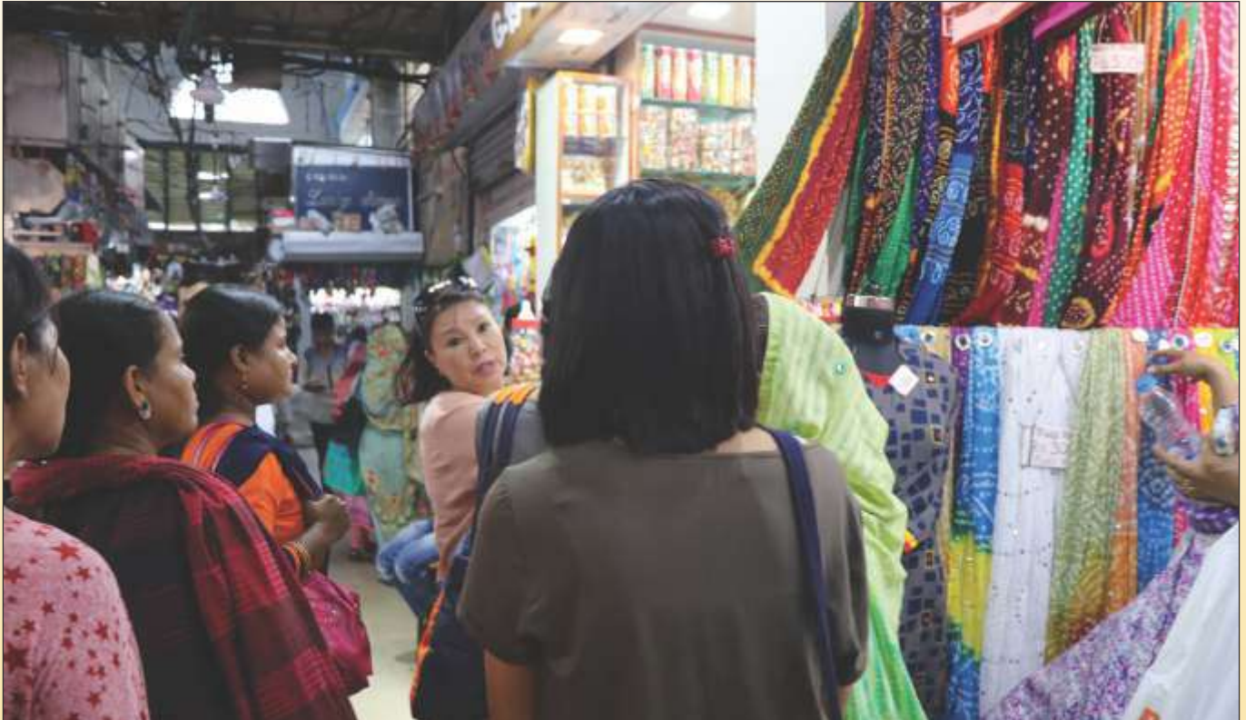
Exposure visit for team at Textile Market, Kolkata, India