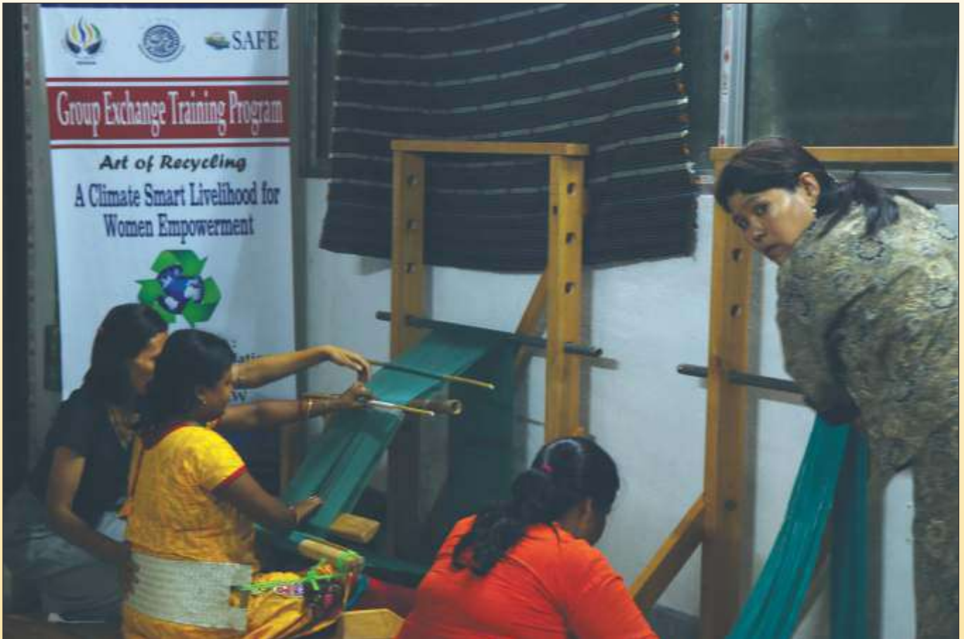
Textile recycling (Weaving) ongoing training at SAFE workshop, Kolkata, India