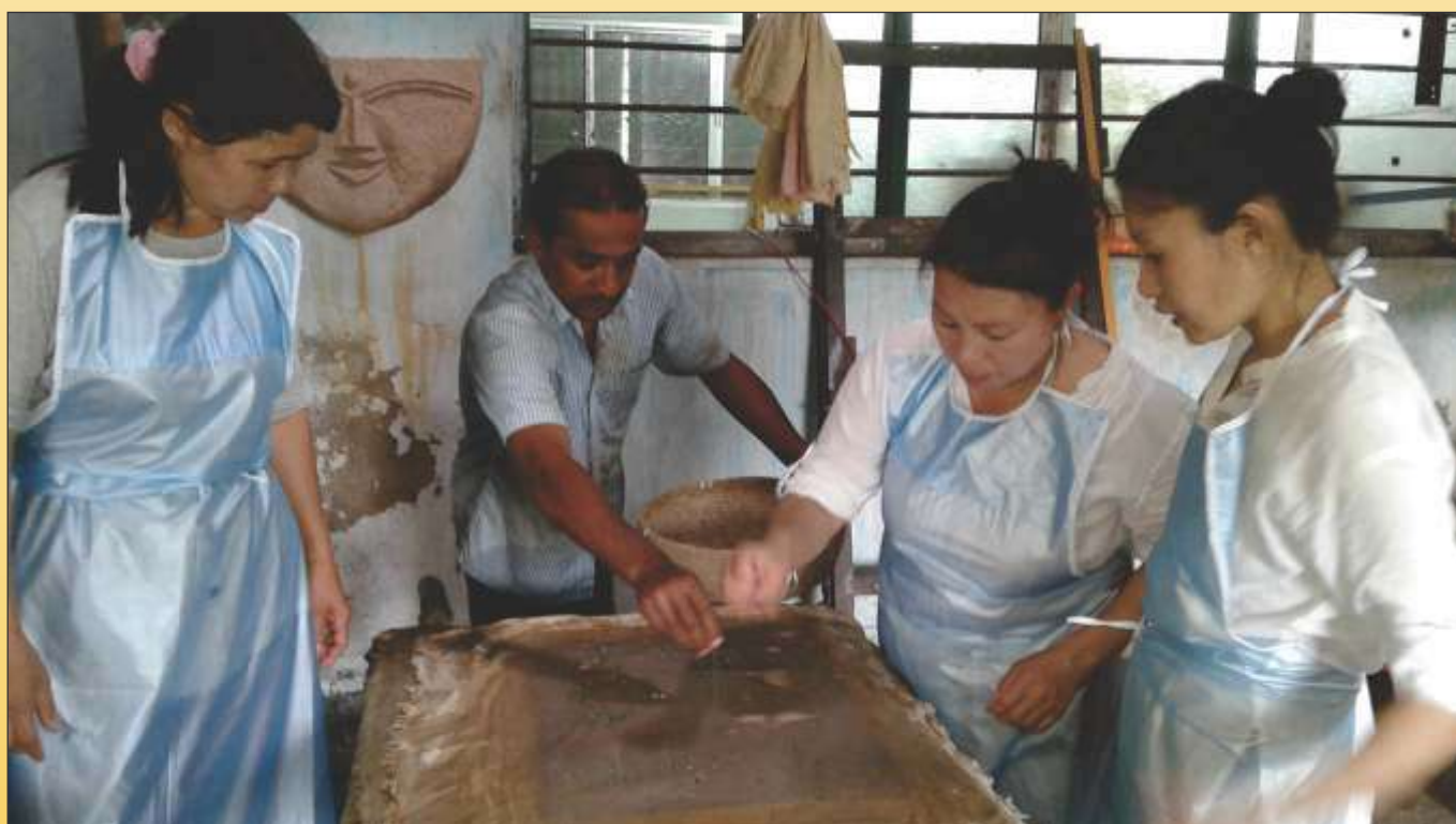
Paper recycling (Paper pulp) ongoing training at SAFE workshop, Kolkata, India