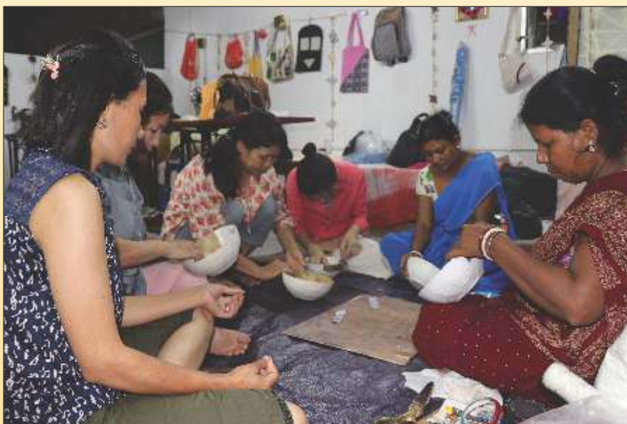
Paper recycling (Paper mache) ongoing training at SAFE workshop, Kolkata, India